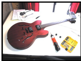
1. Take off hardware & sand.

I was honored to be one of the select Cherokee Artist to custom paint a guitar for the new addition to the Cherokee Nation's Hard Rock Casio in Owasso, Oklahoma. My guitar will be on display in the new addition with the other guitars selected.