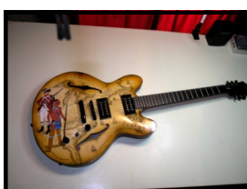
5. Finish with satin finish.