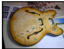
3. Layout design & paint.