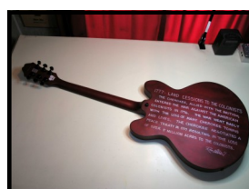
6. Letter story on back.

To remove your name from our mailing list, please click here Questions or comments E-mail us or call 405-567-5566.