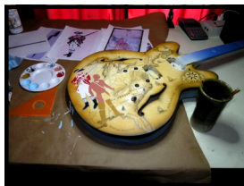
4. Paint details & airbrush.