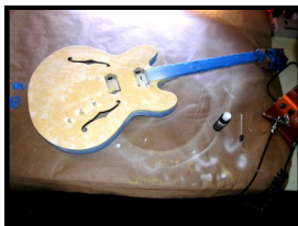
2. Prime & paint base colors.